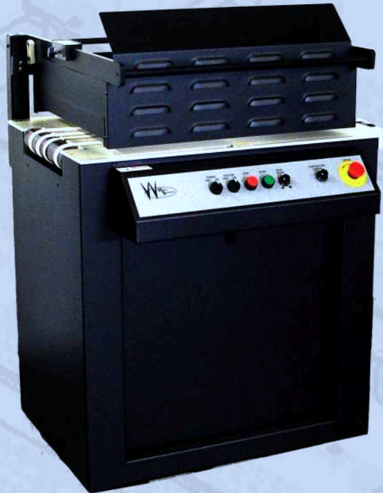
350D shown with: • 9720W NIR Dryer