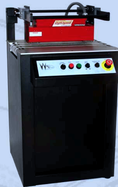
240D shown with: • 4000W IR Dryer

NOTE: The 350D & 240D are also available in transport only versions 350DT & 240DT.