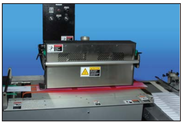
Specially designed bulbs reduce glare and direct most infrared energy towards the ink pattern. This means lower power settings can be used, reducing energy consumption and extending bulb life.