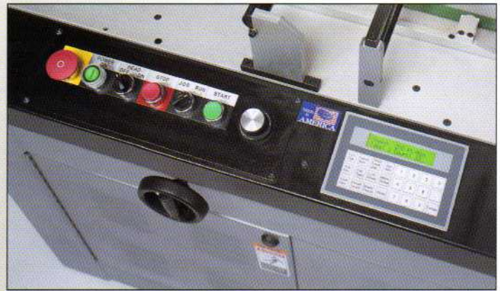
A straightforward operator interface simplifies operator training and setup.

Specifications subject to change without notification Guards have been removed for clarity. Do not operate machine without guards in place.