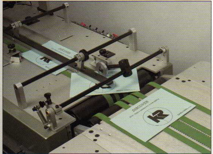
Optional bump turn kit