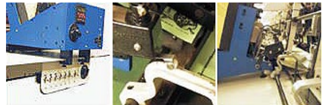
Easy front table mounting