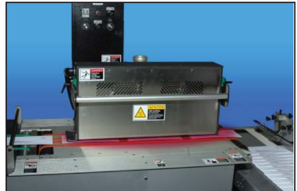
Specially designed bulbs reduce glare and direct most infrared energy towards the ink pattern. This means lower power settings can be used, reducing energy consumption and extending bulb life.