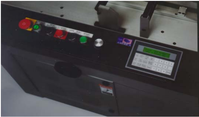
A straightforward operator interface simplifies operator training and setup.

Specifications subject to change without notification Guards have been removed for clarity. Do not operate machine without guards in place.