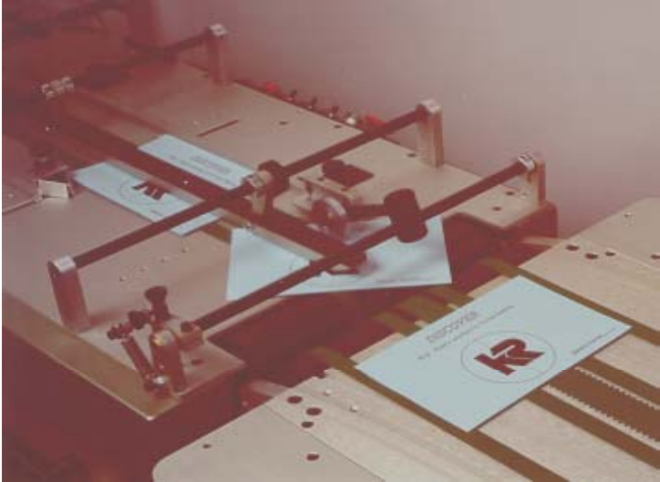
Optional bump turn kit